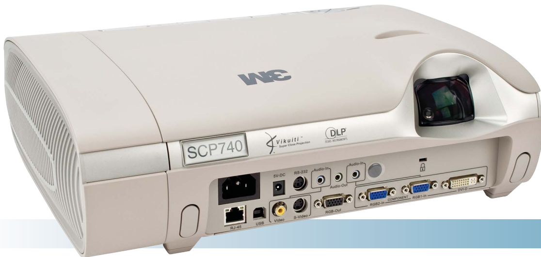
3M SCP740 Projector 78-9236-6999-4

For the ideal projected image to match the latest in WXGA notebooks and popular video formats, the 3M Super Close Projection System SCP740 is the solution you need. The first high brightness, WXGA projector to be available with super close projection technology, the SCP740 has the benefits of DLP™, Brilliant Color™ DVI-D connectivity and an integrated wind tunnel for fan noise reduction. Works better than traditional ceiling mounted projectors because the extreme off-axis short throw reduces light in the presenter's eyes and the full connectivity makes it the perfect tabletop media hub tool!